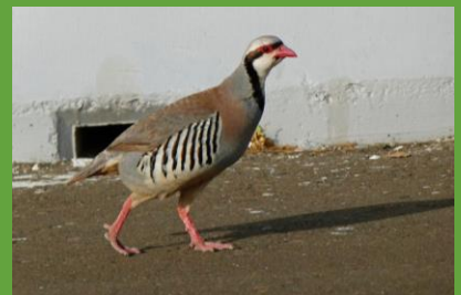
Grey Francolin, Greater Flamingo, Green Mubazzarah, Desert Lark, Chukar Partridge