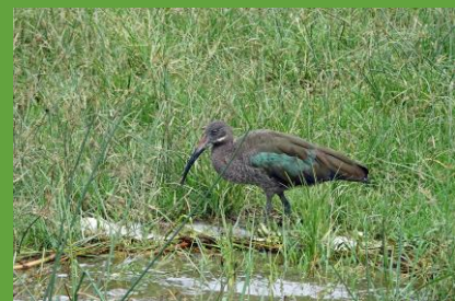
Ground Hornbill, Grey-headed Kingfisher, Mountain Gorilla, Black-headed Gonolek, Hadada Ibis