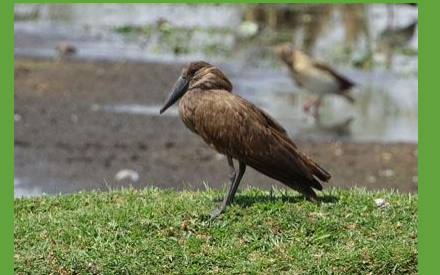
Shoebill, African Jacana, White-browed Robin-chat, Northern Carmine Bee-eater, Hamerkop