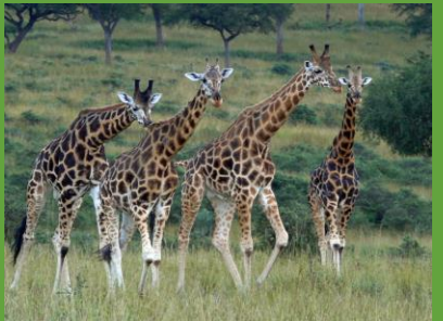
African Fish Eagle with Waterbuck, Yellow Wagtail, Pied Kingfisher, Rock Pratincole, Giraffes