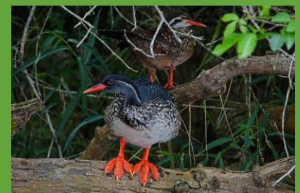
Green-backed Woodpecker, Helmeted Guineafowl, Buffalo, African Finfoot