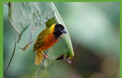
Murchison Falls, wildlife lodge, Chimpanzee, Black-and-white Colobus, Black-headed Weaver