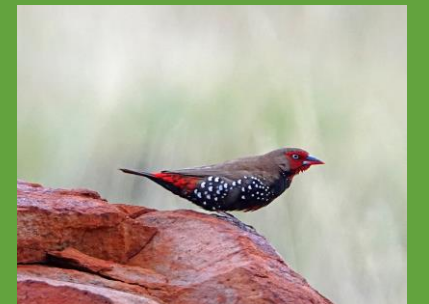
Dolphins at Monkey Mia, Stromatolites, Pilbara sunrise, Little Button-quail, Painted Finch. Left: Sandhill Grasswrens