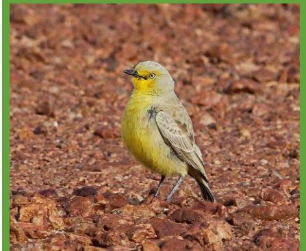
Inland Dotterel, Grey Falcon, Letter-winged Kite, Gibberbird