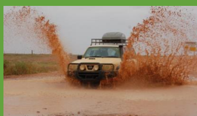
Chestnut-breasted Whiteface, Australian Pratincole, Birding, Black-breasted Buzzard, Wet conditions in the outback