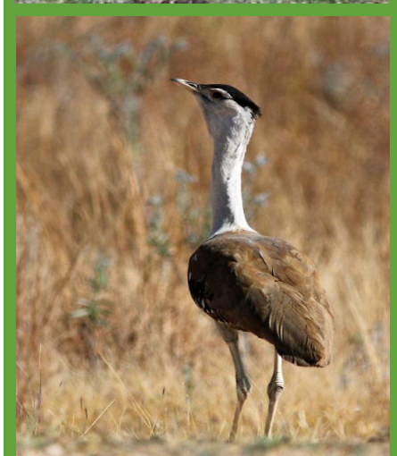
Striated, Grey, Short-tailed Grasswren, Australian Bustard