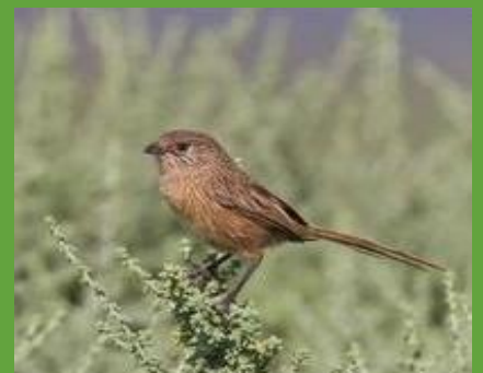
Letter-winged Kite, Flock Bronzewing, Gibberbird, Western Grasswren