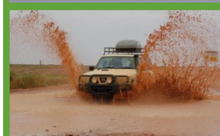
Thick-billed Grasswren, Australian Pratincole, Birding, Black-breasted Buzzard, Wet outback conditions