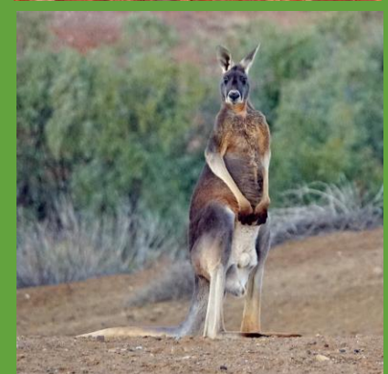
Spinifex Pigeon, Grey Falcon, Inland Dotterel, Red Kangaroo