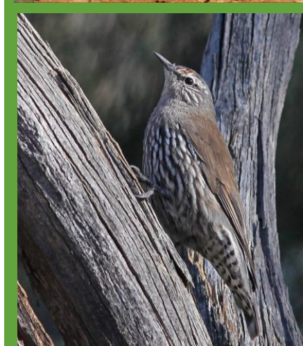
Zebra Finch, Banded Stilt, Splendid Fairy-wren, White-browed Treecreeper