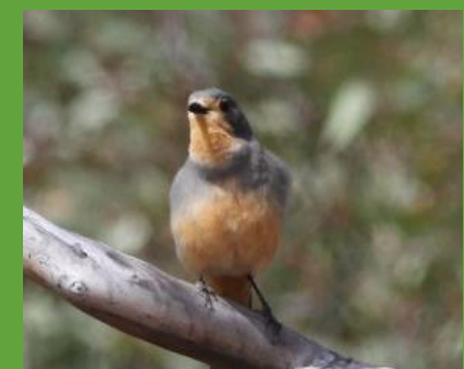
Southern Scrub Robin, Chestnut Quail-thrush, Regent Parrot, Red-lored Whistler