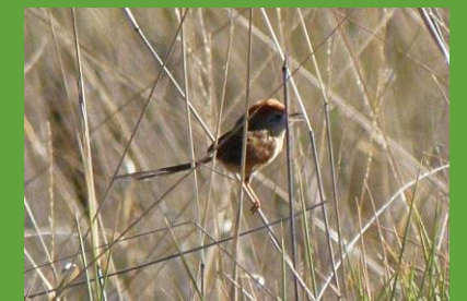
Grey Honeyeater, Painted Finch, Western Bowerbird, Rufous- crowned Emu-wren