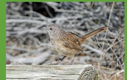
Slaty-backed Thornbill, Black-breasted Buzzard, Spinifex Pigeon, Western Grasswren