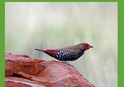
Dolphins at Monkey Mia, Stromatolites, Pilbara sunrise, Little Button-quail, Painted Finch. Left: Sandhill Grasswrens