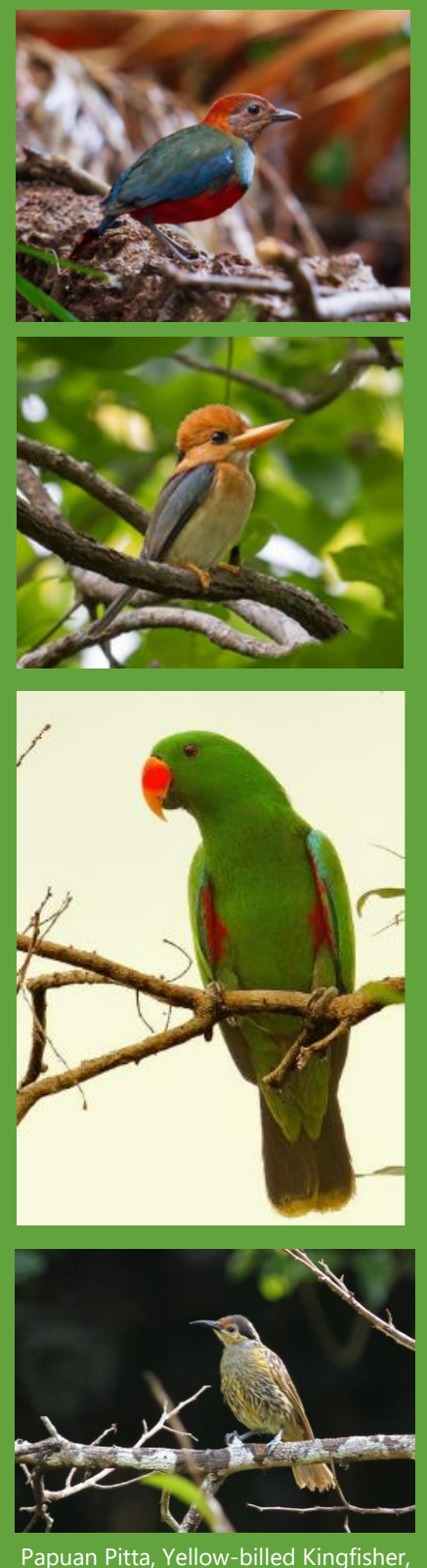
Papuan Pitta, Yellow-billed Kingfisher, Eclectus Parrot; MacLeay's Honeyeater.

<u>(This is day 4 of the 4-day tour)</u> Today we will bird the local area in the early morning in search of some of the more difficult species that may have eluded us earlier or just to get better views or photographs of birds we have seen already, before returning to the airport after lunch for our flight back to Cairns. (accommodation – own arrangements; meals included: B, L.). End of tour.