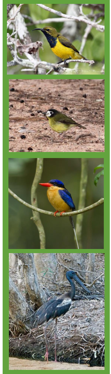
Olive-backed Sunbird, White-faced Robin © P Waanders, Buff-breasted Paradise Kingfisher © Geoff Jones. Black-necked Stork © P Waanders

We'll further explore the Iron Range area visiting Portland Roads and Chilli Beach for shore and sea birds. In this area we have a good chance of Torresian Imperial Pigeon, Striated Heron, Little Egret and Eastern Reef Egrets, Pied Oystercatcher, Pacific Golden Plover, Mongolian Sand Plover and Greater Sand Plover, Eurasian Whimbrel, Common Sandpiper, Greytailed Tattler, Red-necked Stint, Ruddy Turnstone, Silver Gull, Greater Crested Tern, Lesser Crested Tern, Bridled Tern, Little Tern, Black-naped Tern and Brown (or Common) Noddy. In the evening flocks of Metallic