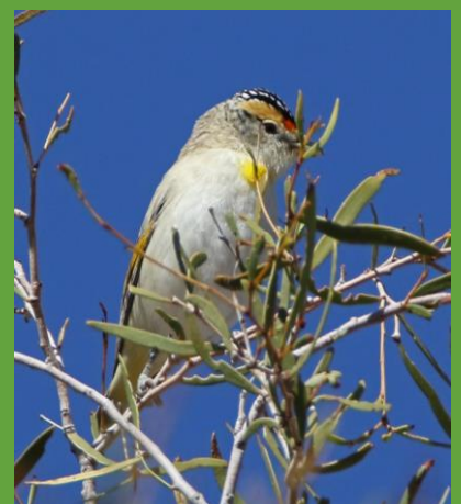
Left: Grey Honeyeater © P Waanders. Top-bottom: Dusky Grasswren © C Watson Pt Lincoln Ringneck, Red-browed Pardalote © P Waanders