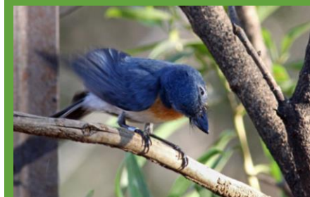
Long-tailed Finch, Australian Pratincole, Sandstone Shrike-thrush, Birding, Broad-billed Flycatcher