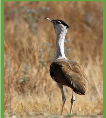
Black-throated Finch, Squatter Pigeon, Black-breasted Buzzard, Australian Bustard