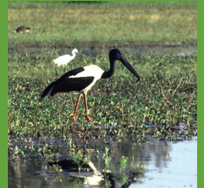
White-quilled Rock-pigeon, Hooded Parrot, Comb-crested Jacana, Black-necked Stork