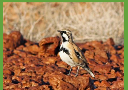
Hall's Babbler, Australian Pratincole, Birding at Bowra, Bourke's Parrot, Cinnamon Quail-thrush