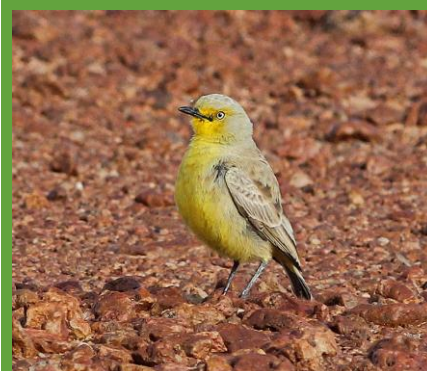
Inland Dotterel, Grey Falcon, Letter-winged Kite, Gibberbird