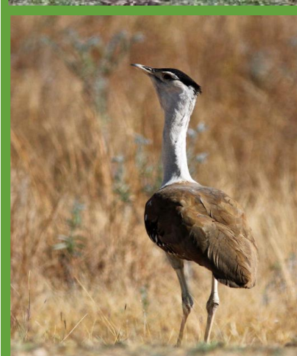
Striated, Grey, Short-tailed Grasswren, Australian Bustard