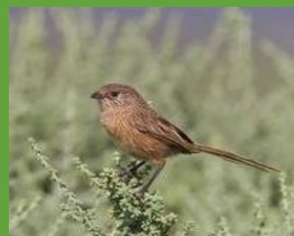
Letter-winged Kite, Flock Bronzewing, Gibberbird, Western Grasswren