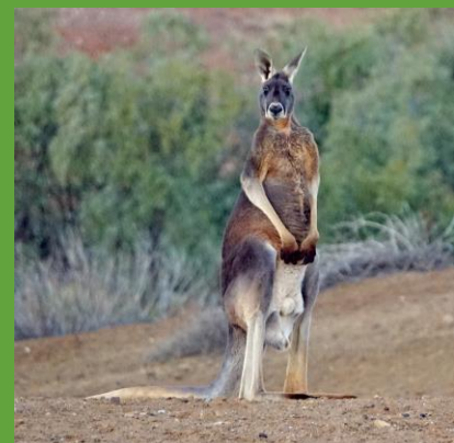
Spinifex Pigeon, Grey Falcon, Inland Dotterel, Red Kangaroo