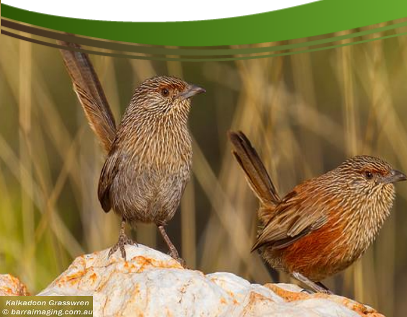
Kalkadoon Grasswren