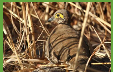
Crimson Finch, Long-tailed Finch, Northern Shrike-tit, Northern Rosella, Partridge Pigeon