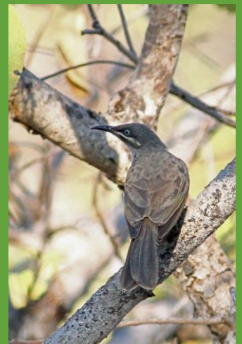
Purple-crowned Fairywren, Red-backed Fairywren, Silver-backed Butcherbird, Kimberley Honeyeater