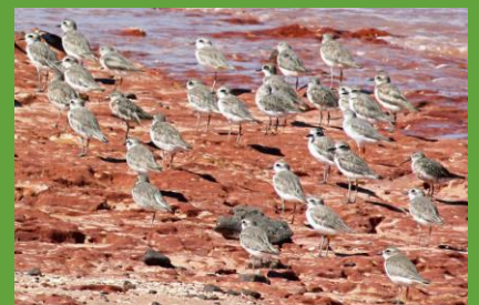
Banded Honeyeater, Bar-breasted Honeyeater, Broad-billed Flycatcher, Buff-sided Robin, Greater Sandplover