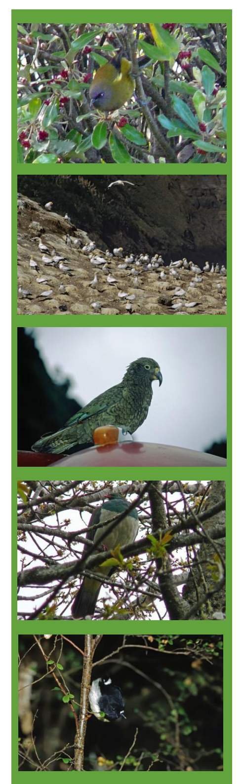
Bellbird, Australasian Gannet, Kea, NZ Pigeon, Tomtit

Day 4: Fri 7 Mar '5 Miranda is renowned for its mudflats with thousands of migratory waders and local residents, especially the unique Wrybill. We should see a number of these unusual birds, and there is always the chance of rarities such as Hudsonian Godwit which has been around the last few years. We'll spend