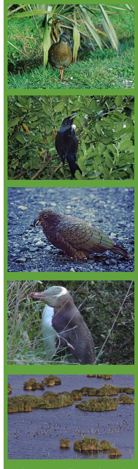
Weka, Tui, Kea, Yellow-eyed Penguin, Canada Geese

Day 13: Sun 16 Mar '25. Today will no doubt be the highlight of the trip. We'll take a short boatride to nearby Ulva Island a beautiful predator-free island sanctuary. In this unspoiled temperate rainforest rare birds and plants thrive in a safe environment mostly unchanged by human activity, with healthy populations of kiwi, saddleback and yellowhead. Here we look for Weka, Kaka, Red- and Yellow-crowned Parakeet, Yellowhead, SI Saddleback, Brown Creeper and with much luck, Fiordland Penguin. Overnight Stewart Island (private en-suite rooms; meals included B, L, D).