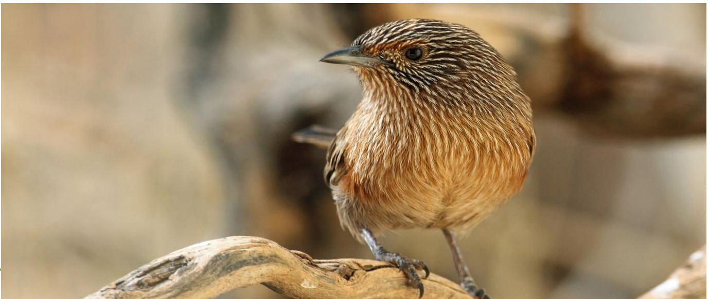
Tour starts Alice Springs, NT & finishes: Yulara/Uluru, NT or Alice Springs, NT