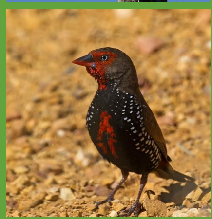
Major Mitchell's Cockatoo © C Grey Falcon © C Watson Painted Finch © G Jones