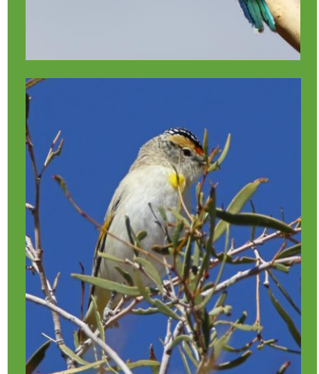
Left: Grey Honeyeater © P Waanders. Top-bottom: Dusky Grasswren © C Watson Pt Lincoln Ringneck, Red-browed Pardalote © P Waanders