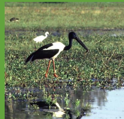
White-quilled Rock-pigeon, Hooded Parrot, Comb-crested Jacana, Black-necked Stork