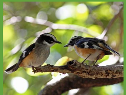
Rufous Owl, Yellow-rumped Mannikin, Buff-sided Robin