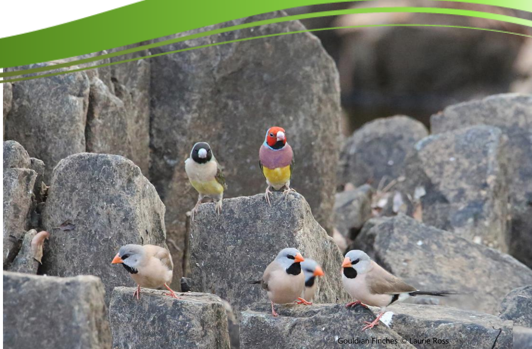
Gouldian Finches

One of Australia's top birding destinations, the Northern Territory's 'Top End' includes tantalizing destinations such as Kakadu National Park, Nitmiluk National Park, Pine Creek, Katherine and Jubara / Gregory National Park (Timber Creek Region). A raft of wonderful birds inhabit this scenic area, including the sought-after Gouldian Finch, the rare Hooded Parrot, the localized Chestnut-quilled Rock Pigeon, the elusive Red Goshawk; the stunning Rainbow Pitta and many other specialties. In addition, we'll look for Saltwater Crocodile, the endemic Short-eared Rock-wallaby and other