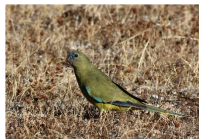
Blue-breasted Fairy-wren, Rock Parrot

Day 6: 7 May '25. A back-up morning for anything we may have missed previously, otherwise there is time for a relaxed morning birding various local coastal spots while working our way east again. After lunch at the amazing, wave-like Pildappa rock just outside Minnipa we'll bird our way to the township of Kimba, located on the edge of another vast "mallee" wilderness area. Overnight Kimba Hotel Motel (private en-suite motel rooms; meals included: B, L, D).