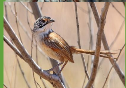
Pt Lincoln Ringneck, Major Mitchell's Cockatoo, Nullarbor Quail-thrush, Rufous Grasswren