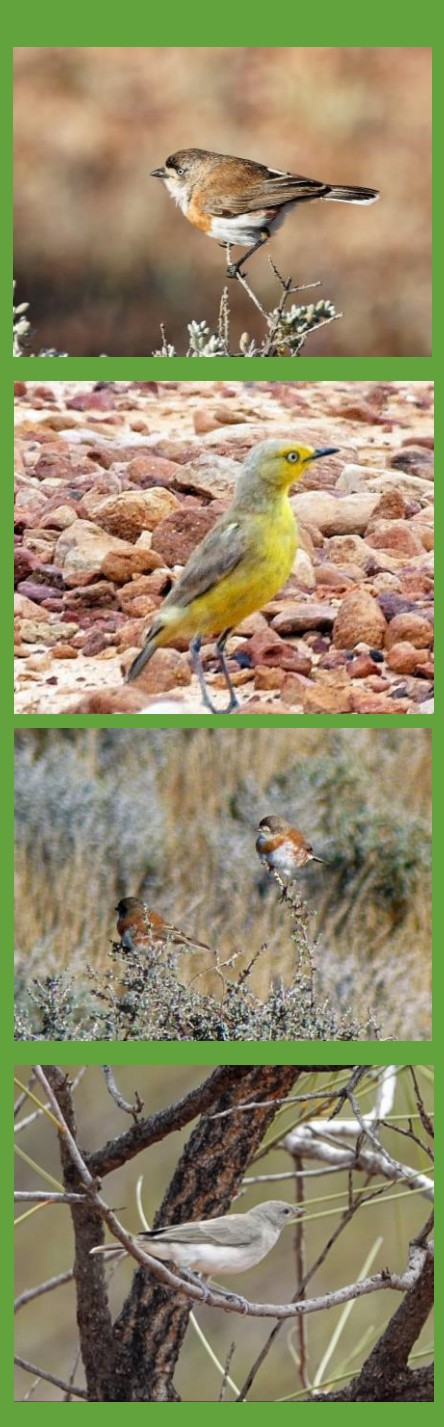
Chestnut-breasted Whiteface, Gibberbird, Chestnut-breasted Whiteface, Grey Honeyeater © P Waanders

Day 4: 18 July 2025. We'll spend a day birding around Alice Springs, where Grey Honeyeater will be the main target of the day. There are plenty of other good birds to be had too: Dusky Grasswren, Rufous-crowned Emu-wren, Spinifexbird, Slaty-backed and Inland Thornbill, Western Bowerbird and Painted Finch are on the menu for today. The tour finishes around 4pm this afternoon and you are welcome to fly out any time from 5pm onwards this evening or stay on in Alice Springs for our Red Centre tour. Accommodation: none ; meals: B, L). If you're staying on for our Red Centre Adventure your hotel and dinner is included tonight, and you'll receive a return-client discount. Contact us for details.