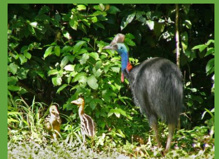
Frilled Monarch, Bar-breasted Honeyeater, Southern Cassowary

Disclaimers: (1) itinerary may be modified slightly due to factors such as availability of accommodation, updated information on the state of accommodation, roads, or birding sites, the discretion of the guides and other factors; (2) until we've received your final payment, tour price may be subject to adjustment in the event of significant cost increases in ground arrangements. See the terms and conditions posted on our website.