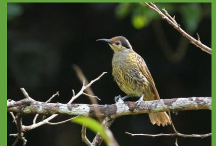
White-faced Robin, Eclectus Parrot, Cassowary, MacLeay's Honeyeater