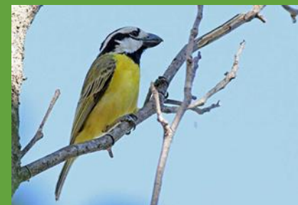
Regent Bowerbird, Temperate rainforest, Noisy Scrubbird, Eastern Shriketit