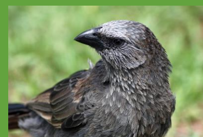
Logrunner, Superb Lyrebird, Aust. Owlet-nightjar, Striated Pardalote, Apostlebird