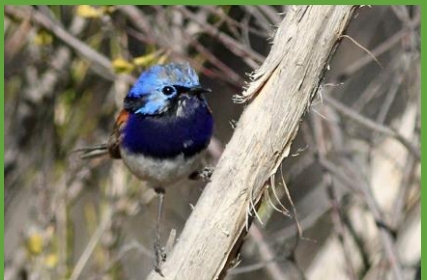
Emu, Short-billed Black Cockatoo, Rufous Treecreeper, Blue-breasted Fairy-wren