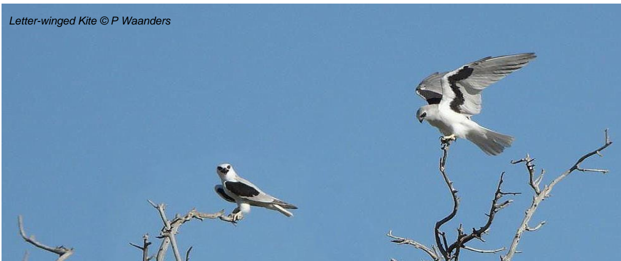
Letter-winged Kite

Additionally, you may want to head up to Cairns for a day's guided birding with our local guide – targeting Yellow-breasted Boatbill and Southern Cassowary (the only other member of both these species' families live in New Guinea). Contact us for details or check our website .