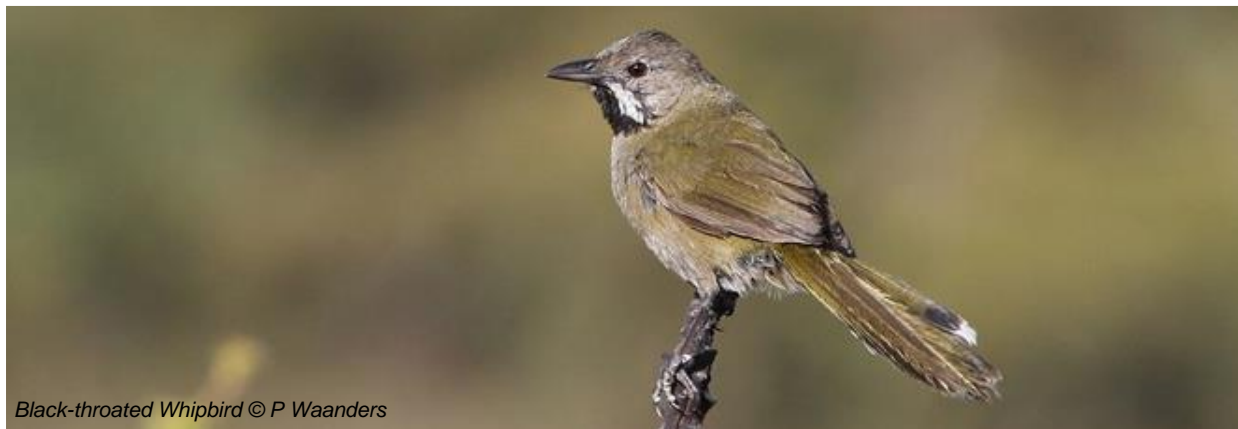
Black-throated Whipbird

Disclaimers: (1) itinerary may be modified slightly due to factors such as availability of accommodation, updated information on the state of accommodation, roads, or birding sites, the discretion of the guides and other factors; (2) until we've received your final payment, tour price may be subject to adjustment in the event of significant cost increases in ground arrangements. See our terms and conditions .