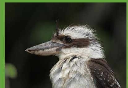
Plains Wanderer, Magpie Goose, Rufous Bristlebird, Laughing Kookaburra