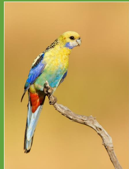
Purple-crowned Fairy-wren, Flock Bronze-wing, Pale-headed Rosella