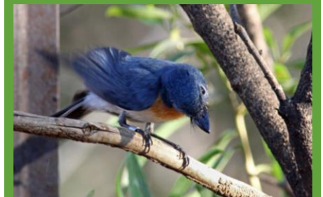
Long-tailed Finch, Australian Pratincole, Sandstone Shrike-thrush, Birding, Broad-billed Flycatcher