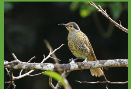
White-faced Robin, Eclectus Parrot, Cassowary, MacLeay's Honeyeater