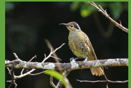
White-faced Robin, Eclectus Parrot, Cassowary, MacLeay's Honeyeater