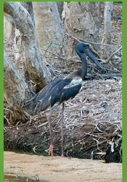
Olive-backed Sunbird, Red Goshawk © P Waanders, Golden-shouldered Parrot © Geoff Jones, Black-necked Stork © P Waanders