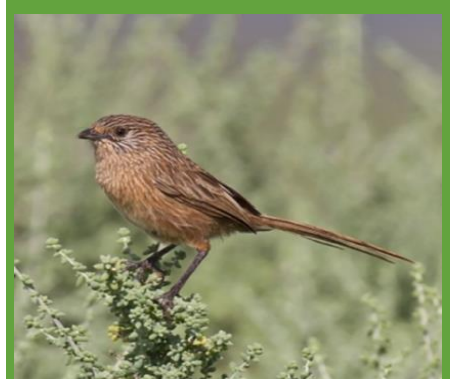
Malleefowl, Birding, Crimson Chat, Western Grasswren