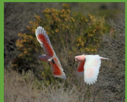
Black-eared Miner, Regent Parrot, Major Mitchell's Cockatoo