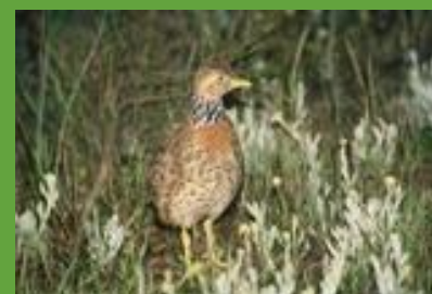
Mallee Emu-wren, Superb Lyrebird, Banded Stilt, Southern Scrub-robin, Plains Wanderer