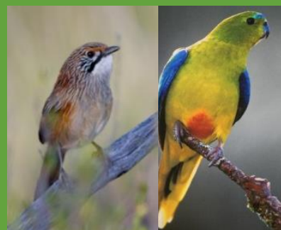
Budgerigar, Great Ocean Road, temperate rainforest, Striated Grass-wren; Orange-bellied Parrot (Tasmania only)