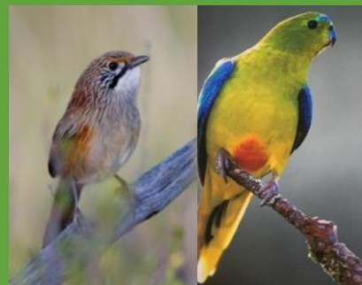
Budgerigar, Great Ocean Road, temperate rainforest, Striated Grasswren; Orange-bellied Parrot (Tasmania only)