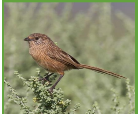
Malleefowl, Birding, Crimson Chat, Western Grasswren