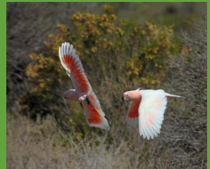
Black-eared Miner, Regent Parrot, Major Mitchell's Cockatoo