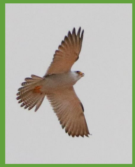
Grey Falcon (,)