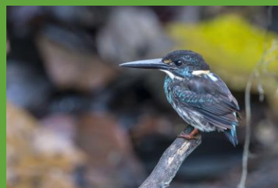
Bornean Ground Cuckoo, Orang Utan ; Blue-banded Pitta ; Bornean Pygmy Elephant ; Blue banded Kingfisher