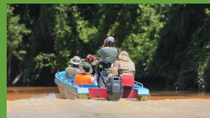
Red Leaf-monkey, Chestnut-naped Forktail, Collared Owlet; Golden-whiskered Barbet; Kinabatangan river