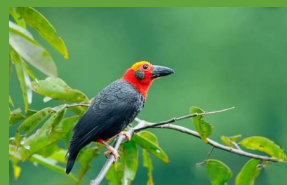
Black-headed Pitta, Bushy-crested Hornbill, Bornean Bristlehead