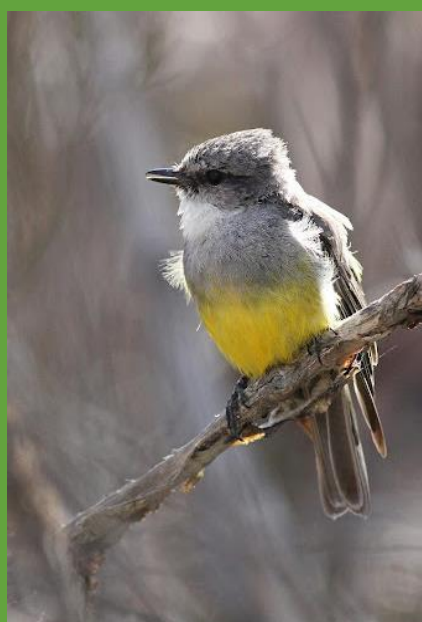
Blue-breasted Fairy-wren, Western Corella, Rock Parrot, Western Yellow Robin