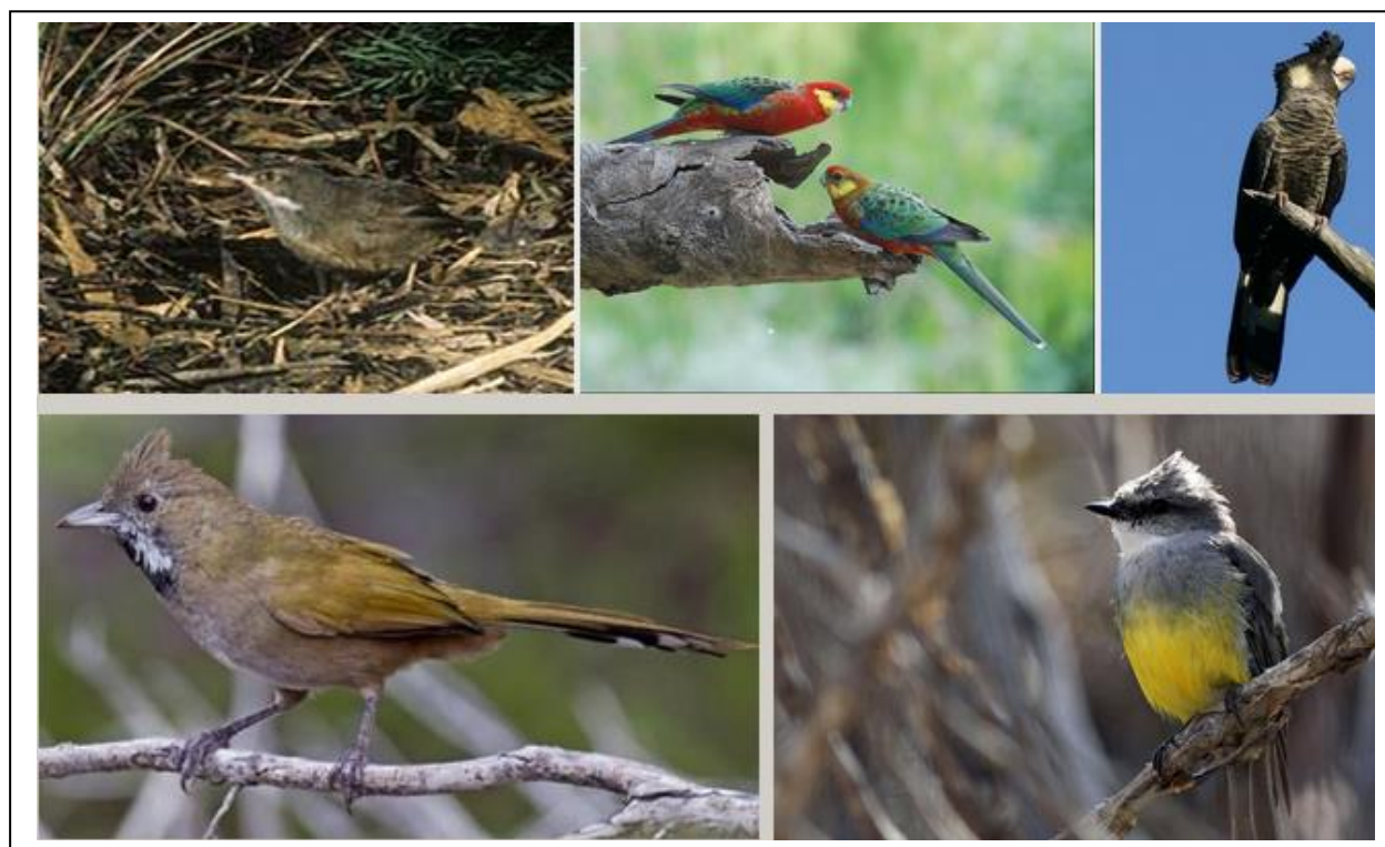
Noisy Scrub-bird, Western Rosella, Short-billed Black Cockatoo, Western Whipbird, Western Yellow Robin

Western Yellow Robin White-breasted Robin Rufous Songlark Silvereye White-backed Swallow Welcome Swallow Tree Martin Mistletoebird Red-eared Firetail Australasian Pipit