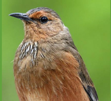
Malleefowl, Noisy Scrub-bird, Short-billed Black Cockatoo, Rufous Treecreeper