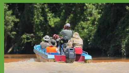
Red Leaf-monkey, Chestnut-naped Forktail, Collared Owlet © Liew Weng Keong; Golden-whiskered Barbet © Jemmann Chen; Kinabatangan river © Endemic Guides Malaysia