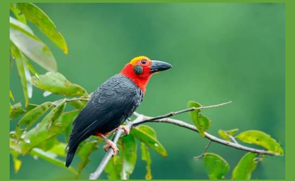
Black-headed Pitta, Bushy-crested Hornbill, Bornean Bristlehead