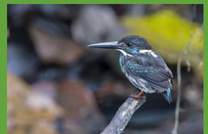
Bornean Ground Cuckoo, Orang Utan ; Blue-banded Pitta ; Bornean Pygmy Elephant ; Blue banded Kingfisher