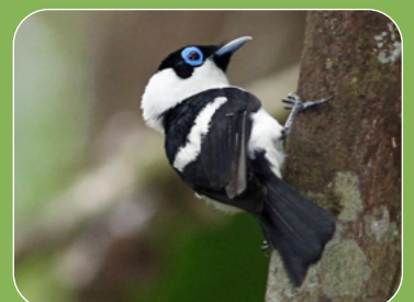
Pacific Emerald Dove, Shining Flycatcher, Black-winged Monarch, Palm Cockatoo, and Frill-necked Monarch.