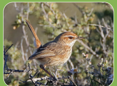
Orange Chat, Dingo, Grey Honeyeater, and Rufous Fieldwren.