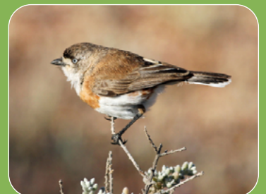
Thick-billed Grasswren, Cinnamon Quail-thrush, Black-breasted Buzzard, Gibberbird, and Chestnut-breasted Whiteface.