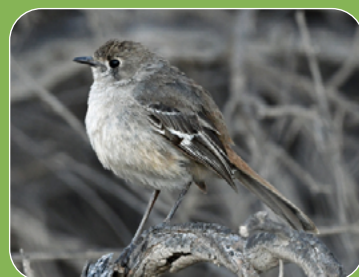
Grey Honeyeater, Western Quail-thrush, Sandhill Grasswren, and Southern Scrubrobin.