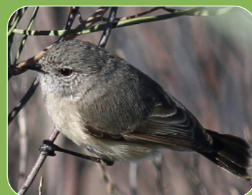
Pilbara Grasswren, Rufous-crowned Emu-wren, Spinifexbird, Painted Finch, and Slaty-backed Thornbill.