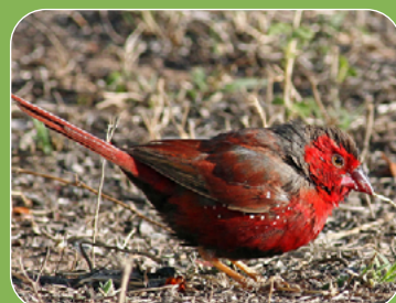
Yellow-tinted Honeyeater, Buff-sided Robin, Varied Lorikeet, Northern Rosella, and Crimson Finch.