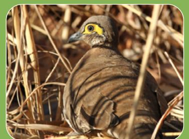
Purple-crowned Fairywren, Double-barred Finch, Black Grasswren, Kimberley Honeyeater, and Partridge Pigeon.