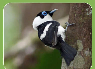
Pacific Emerald Dove, Shining Flycatcher, Black-winged Monarch, Palm Cockatoo, and Frill-necked Monarch.