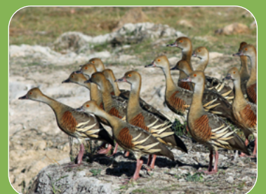
Sahul Sunbird, Southern Cassowary, Eastern Curlew, Azure Kingfisher, and Plumed Whistling-Duck.