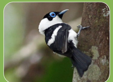
Pacific Emerald Dove, Shining Flycatcher, Black-winged Monarch, Palm Cockatoo, and Frill-necked Monarch.