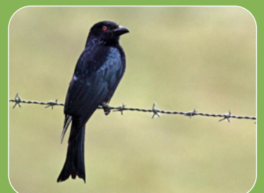
Bar-shouldered Dove, Mangrove Robin, Comb-crested Jacana, Lumbholtz' Tree Kangaroo, and Spangled Drongo.