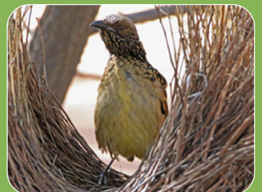
Bourke's Parrot, Crimson Chat, Pied Honeyeater, Rufous Grasswren, and Western Bowerbird.