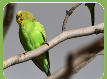
Grey Honeyeater, Zebra Finch, Uluru, Diamond Dove, and Budgerigar.