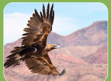
Painted Finch, Australian (Port Lincoln) Ringneck, and Wedge-tailed Eagle.