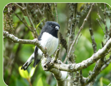
Kokako, Takahē, New Zealand Bellbird, Wrybill, and Tomtit.