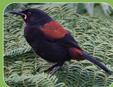
Blue Duck, Buller's Albatross, Kaka, North Island Brown Kiwi, and North Island Saddleback.