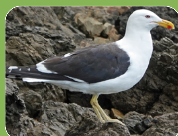
Kea, Rifleman, Yellow-eyed Penguin, and Kelp Gull.