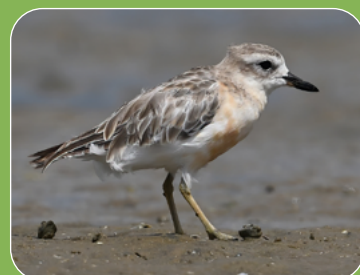
New Zealand Fantail, Orange-fronted Parakeet, Whitehead, Weka, New Zealand Dotterel.