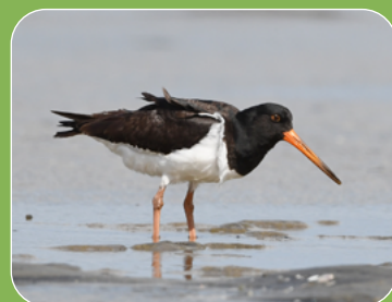
Southern Royal Albatross, King Shag, North Island Stitchbird, Southern Giant Petrel, and Variable Oystercatcher.