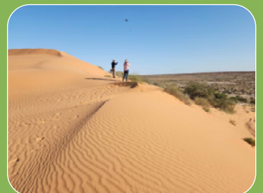
Letter-winged Kite, Australian Bustard, Pied Honeyeater, and Opalton Grasswren.