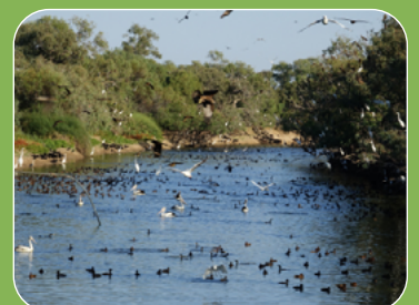
Striated Grasswren, Mallee Emu-wren, Chestnut-breasted Quail-thrush, and Orange Chat. All sorts of bird flock to the river.