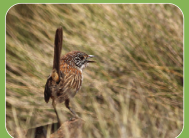
Red-lored Whistler, Western Grasswren, Blue-bonnet, and Short-tailed Grasswren.