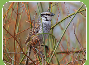
Grey Falcon, Flock Bronzewing, Eyrean Grasswren, Banded Whiteface, and Grey Grasswren.