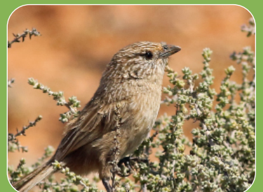
Chirruping Wedgebill, Inland Dotterel, Cinnamon Quail-thrush, Budgerigar, and Thick-billed Grasswren.