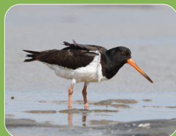
Southern Royal Albatross, King Shag, North Island Stitchbird, Southern Giant Petrel, and Variable Oystercatcher.