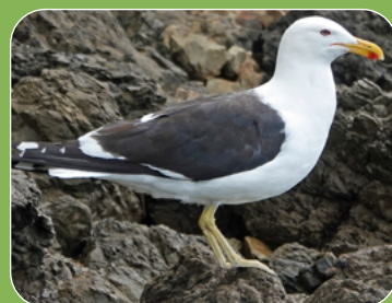
Kea, Rifleman, Yellow-eyed Penguin, and Kelp Gull.