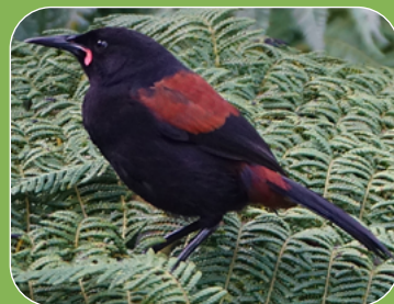
Blue Duck, Buller's Albatross, Kaka, North Island Brown Kiwi, and North Island Saddleback.