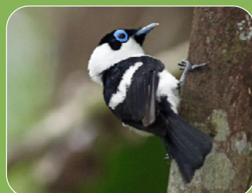
Pacific Emerald Dove, Shining Flycatcher, Black-winged Monarch, Palm Cockatoo, and Frill-necked Monarch.