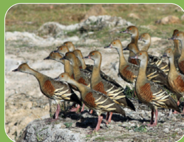
Sahul Sunbird, Southern Cassowary, Eastern Curlew, Azure Kingfisher, and Plumed Whistling-Duck.