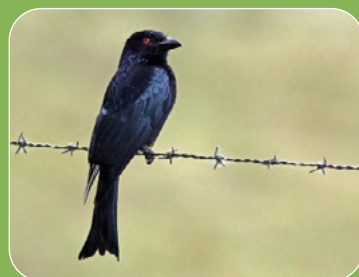
Bar-shouldered Dove, Mangrove Robin, Comb-crested Jacana, Lumbholtz' Tree Kangaroo, and Spangled Drongo.