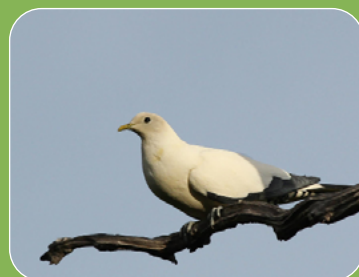
Blue-faced Honeyeater, Red Goshawk, Black Bit- tern, Pied Imperial-Pigeon.