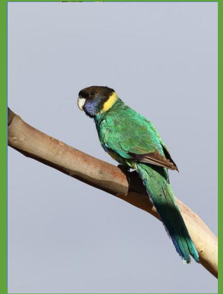
Pt Lincoln Ringneck, Rufous Grasswren

Disclaimers: (1) itinerary may be modified slightly due to factors such as availability of accommodation, updated information on the state of accommodation, roads, or birding sites, the discretion of the guides and other factors; (2) until we've received your final payment, tour price may be subject to adjustment in the event of significant cost increases in ground arrangements. See our terms and conditions .