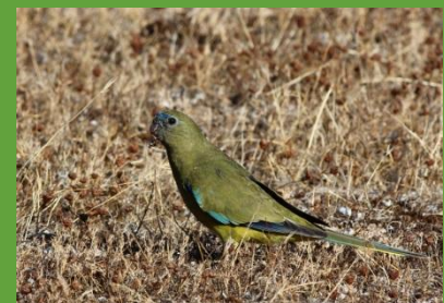
Naretha Bluebonnet, Copperback Quail-thrush, Western Grasswren, Blue-breasted F'wren, Rock Parrot