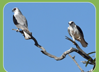
Letter-winged Kite, Grey Falcon, Kalkadoon Grasswren, Painted Finch, and once more Letter-winged Kite.