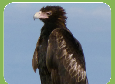
Grey Falcon, Cinnamon Quail-thrush, Black Falcon, Banded Whiteface, and Wedge-tailed Eagle.