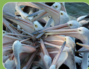
Western Whipbird, Crimson Rosella, Black-faced Cormorant, Fairy Tern, and Australian Pelican.