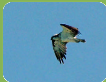
New-Holland Honeyeater, New Zealand Fur Seals, Glossy Black-Cockatoo, Scarlet Robin, and Eastern Osprey.