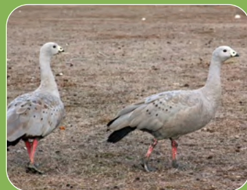
Crested Tern, Koala, Tammar Wallaby, and Cape Barren Goose