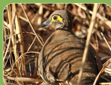
Purple-crowned Fairywren, Double-barred Finch, Black Grasswren, Kimberley Honeyeater, and Partridge Pigeon.