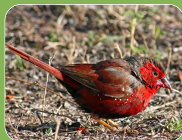
Yellow-tinted Honeyeater, Buff-sided Robin, Varied Lorikeet, Northern Rosella, and Crimson Finch.