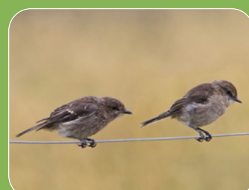
Tasmanian Thornbill, Forty-spotted Pardalote, Yellow-throated Honeyeater, Swift Parrot, and Dusky Robin.