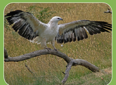
Orange-bellied Parrot, Beautiful Firetail, Blue-winged Parrot, and White-bellied Sea Eagle.