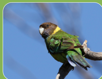
Black-throated Whipbird, Western Fieldwren, Short-billed Black-Cockatoo, Western Spinebill, and Australian (28) Ringneck