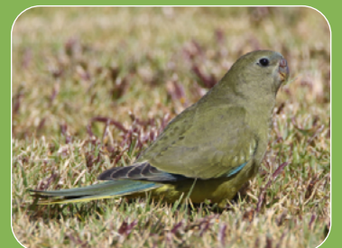
White-cheeked Honeyeater, Western Grey Kangaroo, Southern Emu-wren, Brush Bronzewing, and Rock Parrot.