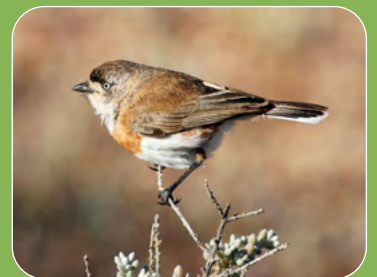
Thick-billed Grasswren, Cinnamon Quail-thrush, Black-breasted Buzzard, Gibberbird, and Chestnut-breasted Whiteface.