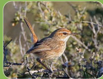
Orange Chat, Dingo, Grey Honeyeater, and Rufous Fieldwren.